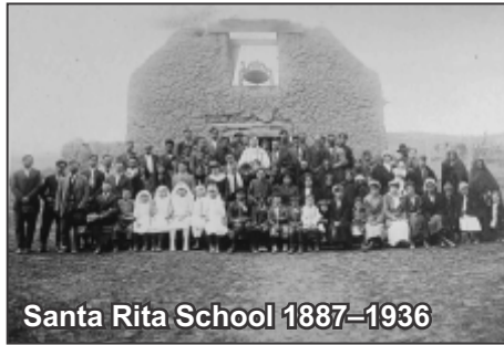
Santa Rita School 1887-1936

Santa Rita, or Riley , is one of New Mexico’s favorite ghost towns, located in Socorro County north of Magdalena, One of the remaining landmark buildings is the old schoolhouse. It was built by the WPA in 1937. The original school was built around 1887 though nothing is known about this first school.