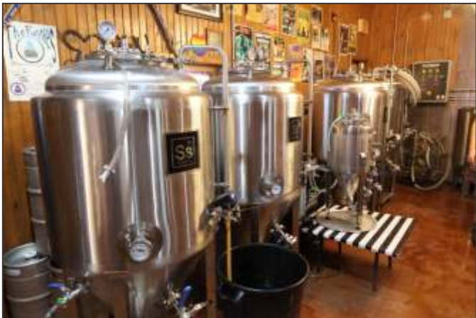
The 2024 Oktoberfest brew is "cooking" in the Capitol Bar's new brewery, located in the naturally cooled basement.

For more information on the history of Socorro's Territorial Saloons, read this history article: https://socorro-history.org/HISTORY/PH_History/201010_saloons_1.pdf The history of the Capitol Bar, now a Registered Historic Landmark, is here: https://socorro-history.org/HISTORY/PH_History/201011_saloons_2.pdf