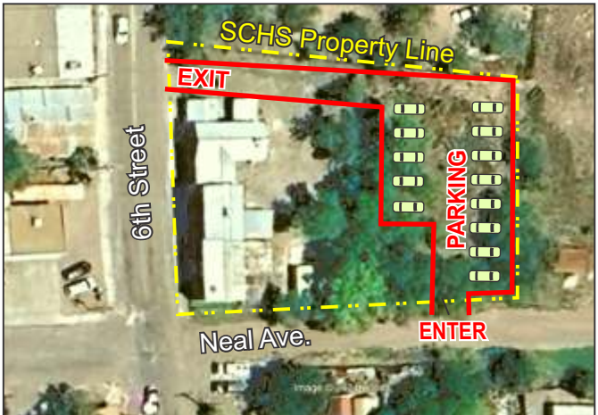
GoogleEarth image showing location of the new SCHS parking area at the Hammel Museum.

Frankly, we don't know yet how many cars will fit in the new parking area. We're hoping about a dozen. The new lot is intended for those with Handicap placards or to make it easier for those