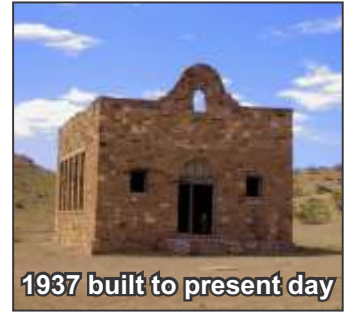
1937 built to present day