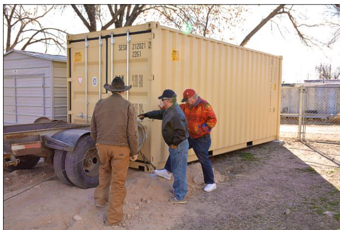
Centering the unit onto the concrete piers