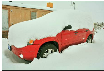
Did your car look like this?