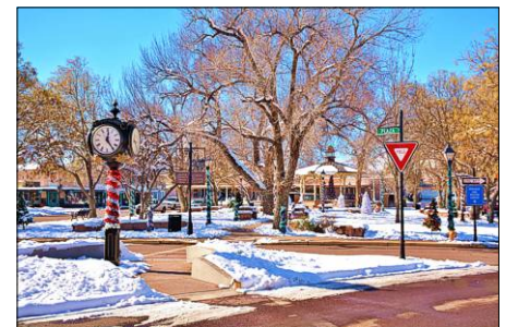
Snow melting on the Socorro plaza