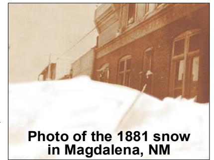
Photo of the 1881 snow in Magdalena, NM

Unfortunately, the newspaper accounts do not report the depth of the historic snows, just that it was "the deepest snow the city has ever seen."