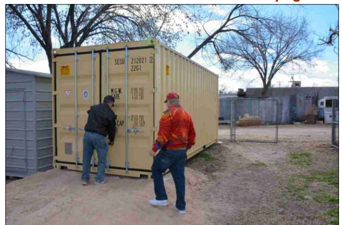
Locking the container after the inspection