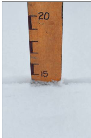
Paul's snow gauge near Polvadera

Crippling snow fell across New Mexico that paralyzed the south and east portions of the state.