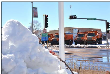
County crews clearing the roads