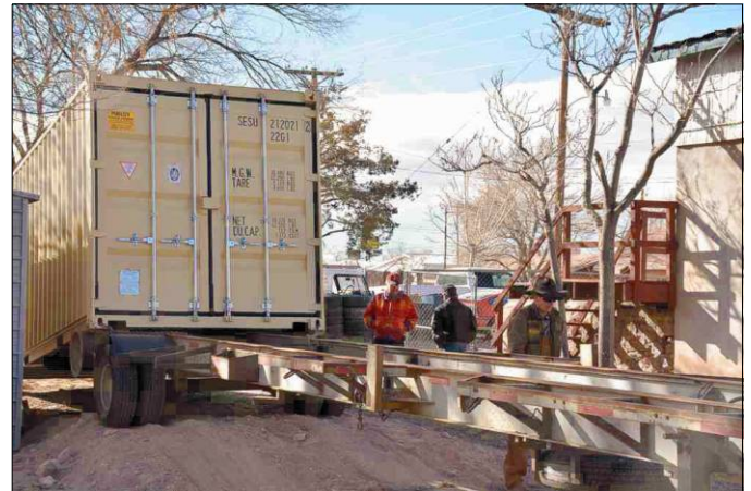
Storage unit being delivered

The SCHS Board explored several options. A room could be added to the museum, adding heating and air conditioning. Or, an existing room rebuilt with heat and AC. However, these or similar approaches would alter the historic significance of the building and likely be cost prohibitive. The Board decided the only reasonable solution was to purchase our own stand-alone storage container that would be heated and cooled for environmental control, and secure enough to safely store our historic materials. A water-tight ocean going shipping container was selected. Thousands of these are used across the country for various storage needs. And, for good reason. They are remarkably well built and substantial.