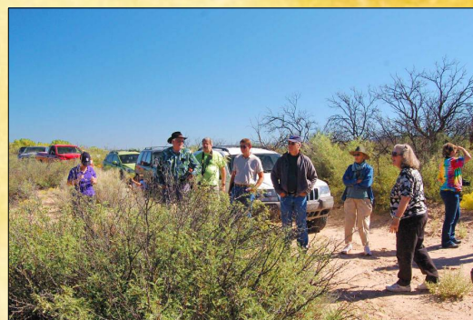
Learn local history with "boots on the ground." Guides describe the history at each stop with opportunities to explore the sites on your own.