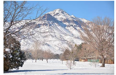
Snow covered "M" Mountain

Hardly a highway was open east of the Rio Grande and sufficient to make the national news. Closed were I-40, US60, US380 and everything in between. State police left I-25 open, in spite of the deep, snow packed conditions around Socorro, to route the thousands of stranded cars and trucks in Albuquerque south to I-10.