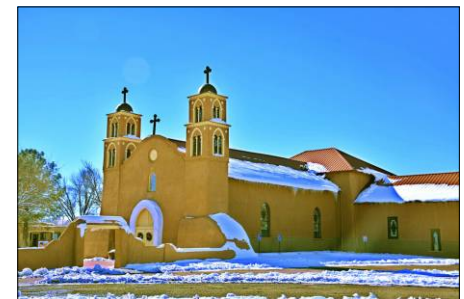
San Miguel Church