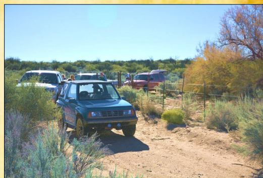
The SCHS guided auto tour allows you to visit numerous Socorro County historical sites in your own automobile.

$100 per person; $85 SCHS members $ 50 children 10-18; children under 10 free with adult