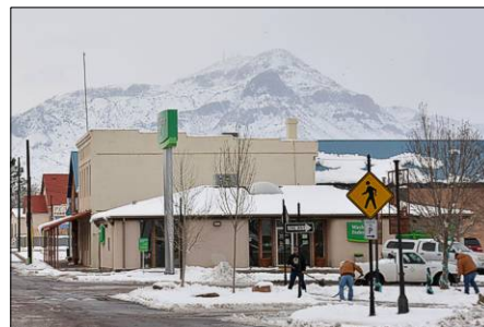
Shoveling snow north of the plaza