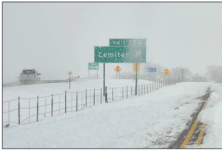
I-25 getting socked in