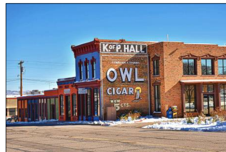
Historic Manzanera Street