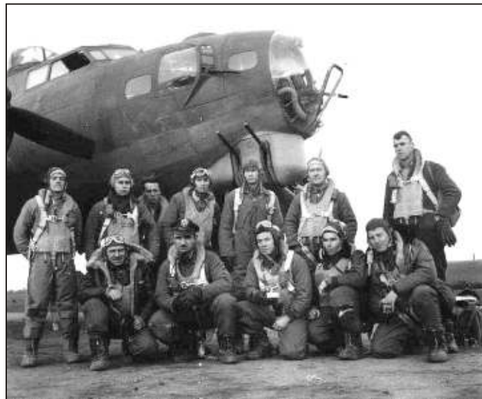
Army Air Force archive photos exist for many of the nearly 13,000 B-17 crews. A photo of Pratt's B-17 crew, still in training, could not be located.

In early October 1942, Pratt's crew was transferred to the night flight training command. By mid-October, Pratt had accumulated 368 flight hours, with 86 hours